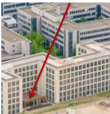
Location of meeting room Donau

GIZ Office Friedrich Ebert Alee 36, Bonn (15 minute walk from WCC Bonn or U-Bahn via Heussallee; Exit Ollenhauerstr.) Meeting Room ,Donau', ground floor